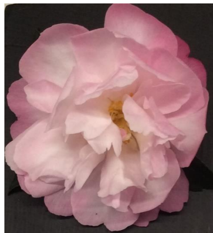
Champlon Bloom April meeting. C. sasanqua 'Paradise Blush'. Class 3 Sasanqua other forms.