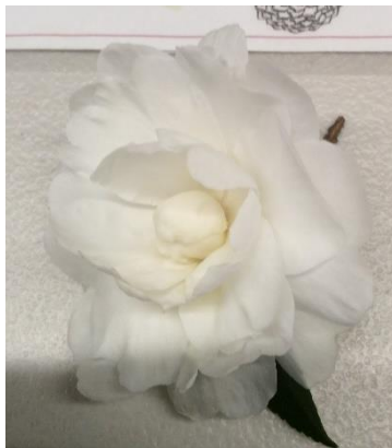
C. sasanqua 'Mine No Yaki'. Class 2 Sasanqua formal double.