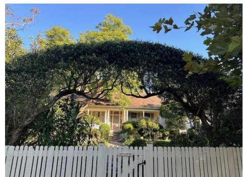
'Eryldene' entrance.