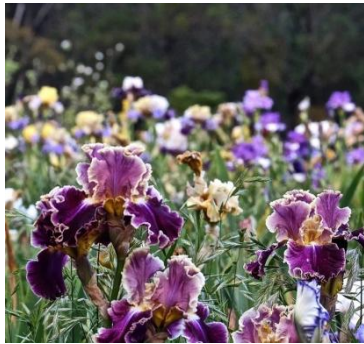
Growing in the Field