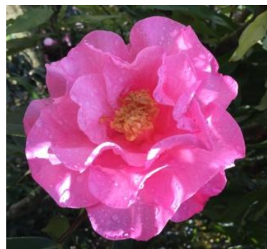
New Day Rise