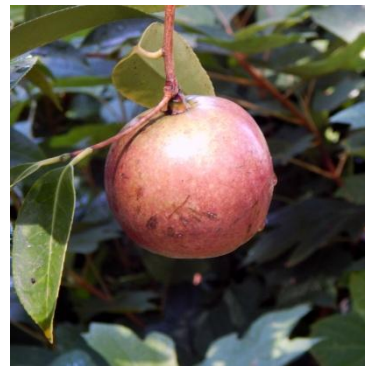
C. japonica variety macrocarpa – Bradford King