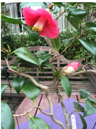
Unryu-Tsubaki as Bonsai- D Low

This is seen in C. japonica 'unryu' (zig zag) which has a small single rose red flower where every node on the stem makes a 45 degree turn which results in a maze of zig zag branches. It was registered by the Kyoto Garden Club of Japan in 1967. The flower color description is also odd. The Camellia Nomenclature describes the flower as pink and International Camellia Register as crimson. The Camellia Forrest Nursery describes it as rose red. When a color is described as rose red, it is a color tone between pink and red. This means some perceive the color as pink, others red. What we have is an example of different people's perception of color. In addition, micro climates and culture may also contribute to a flower having a more pink or red tone.