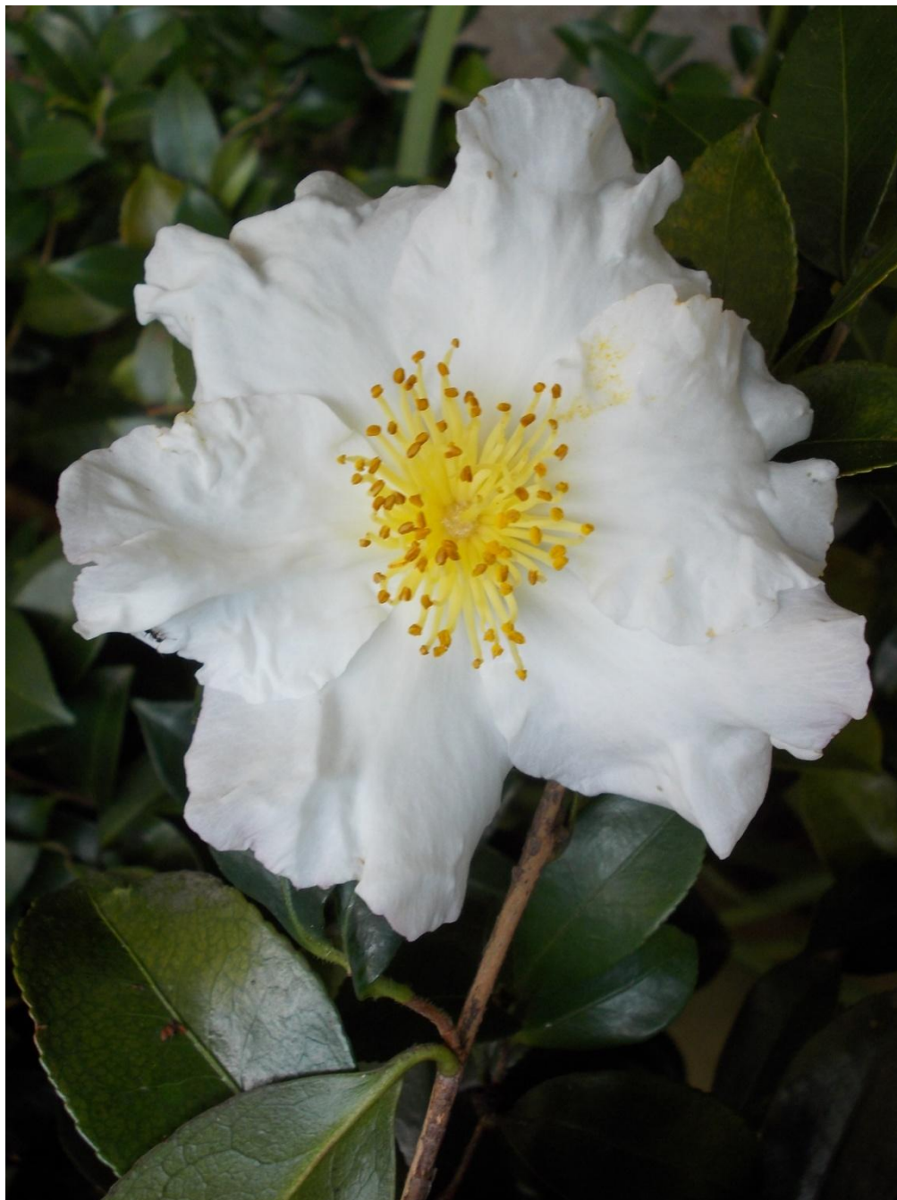
IT'S MARCH AND SASANQUA TIME- 'PARADISE BARBARA'