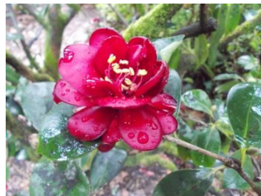
'Kuro-tsubaki' - Bradford King and C Low