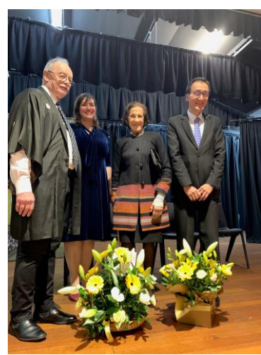
The Guests of Honour