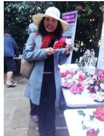
A Guest at our Display