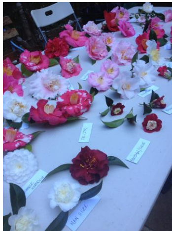
One of 3 Tables