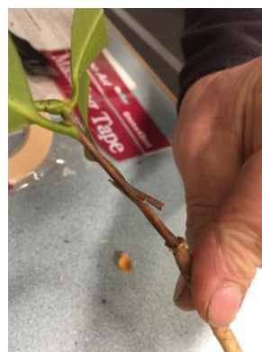
The Whip and Tongue