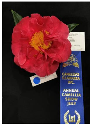
Guilio Nuccio - R Griffiths