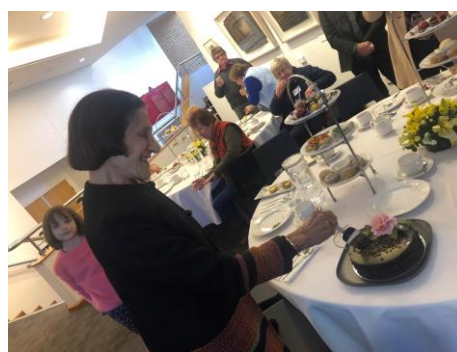
Carefully Does It