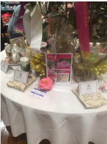
A Prize Bench