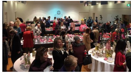
What a Crowd