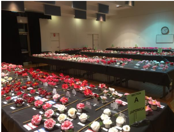
Our 50 th Anniversary Show Benches