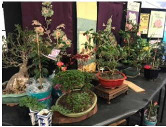
The Bonsai Display