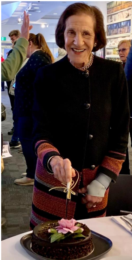
Our patron cutting the Camellia cake