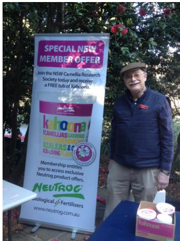
Signed Up 2 New Members

We gained two paid up new members and one possible on the day, and many enquiries regarding ID, improving plant health and tree planting advice.