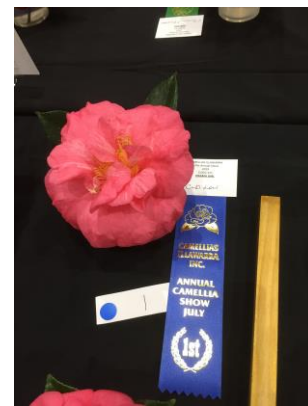
Drama Girl - CG&D Low